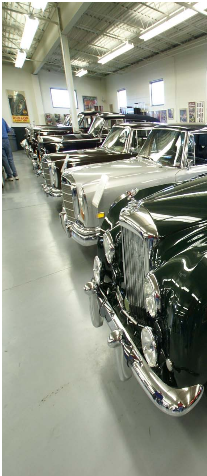
Figure 1 Hunter Engineering Tour

and then you have your entry tickets as well as a close place to park.