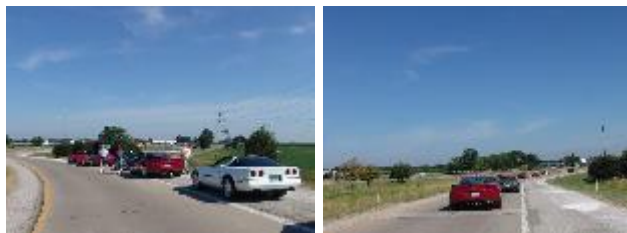
Joining Up to Go

Saturday morning July 2nd, chapter members & guests from both Illinois and Missouri gathered together for a road trip to west central Illinois, our destination, 50 miles north of St. Louis, to Gillespie Ill., to the home of D&A Corvette.